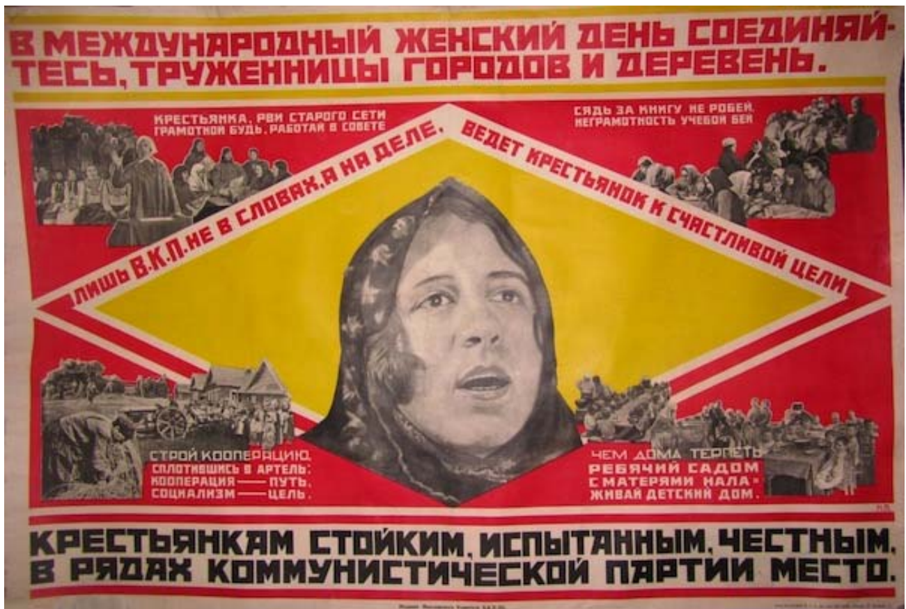
Soviet International Women's Day Poster, 1930s